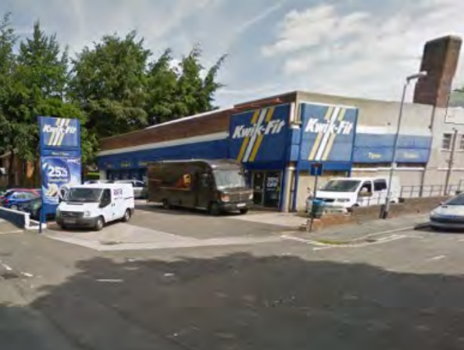
Kwik Fit, Mansfield.

Kwik Fit has been encouraging customers to pay for expensive repairs and has changed them for parts